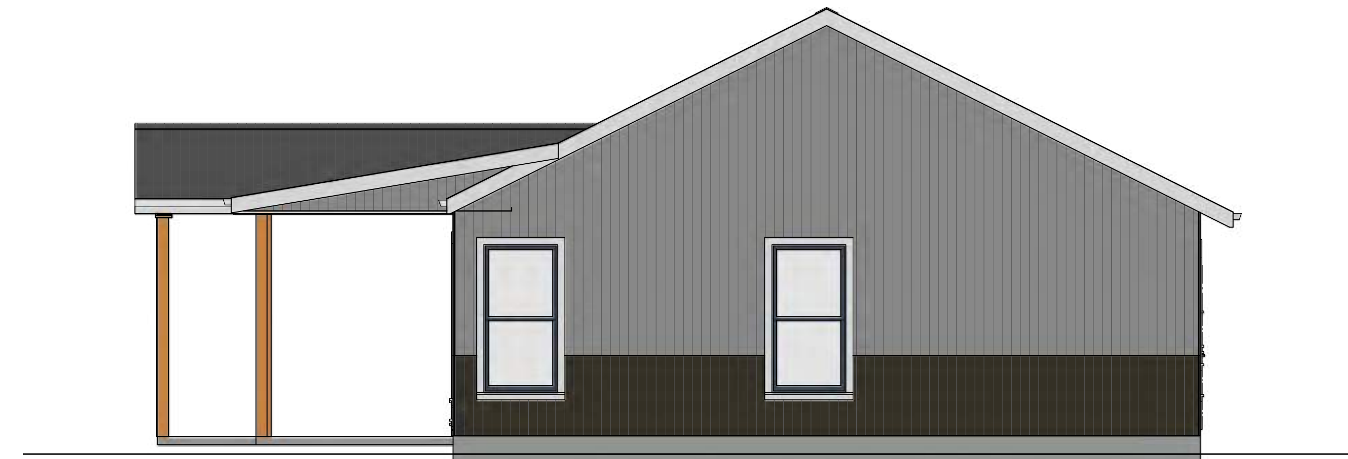
RIGHT Elevation 4

THESE PLANS ARE THE SOLE PROPERTY OF SUMMERTOWN METALS, LLC. ANY UNAUTHORIZED REPRODUCTION OF THESE PLANS IS STRICTLY PROHIBITED.