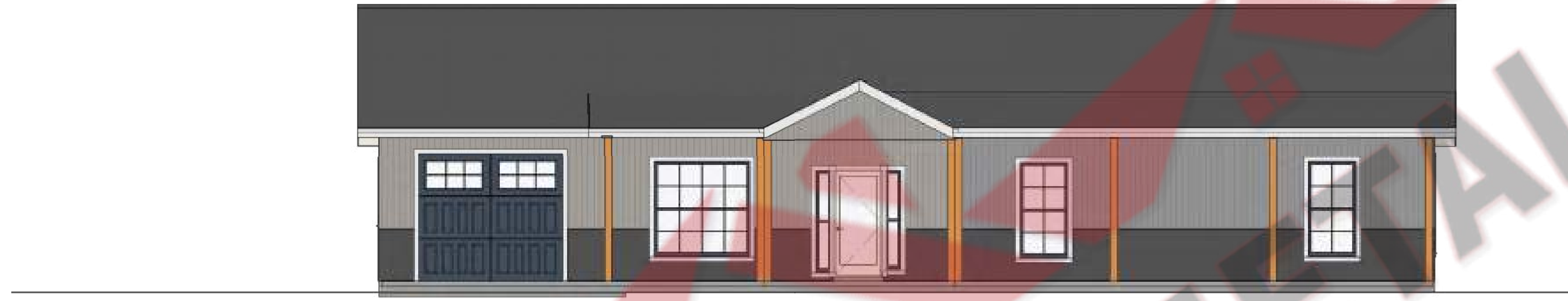
FRONT Elevation 1