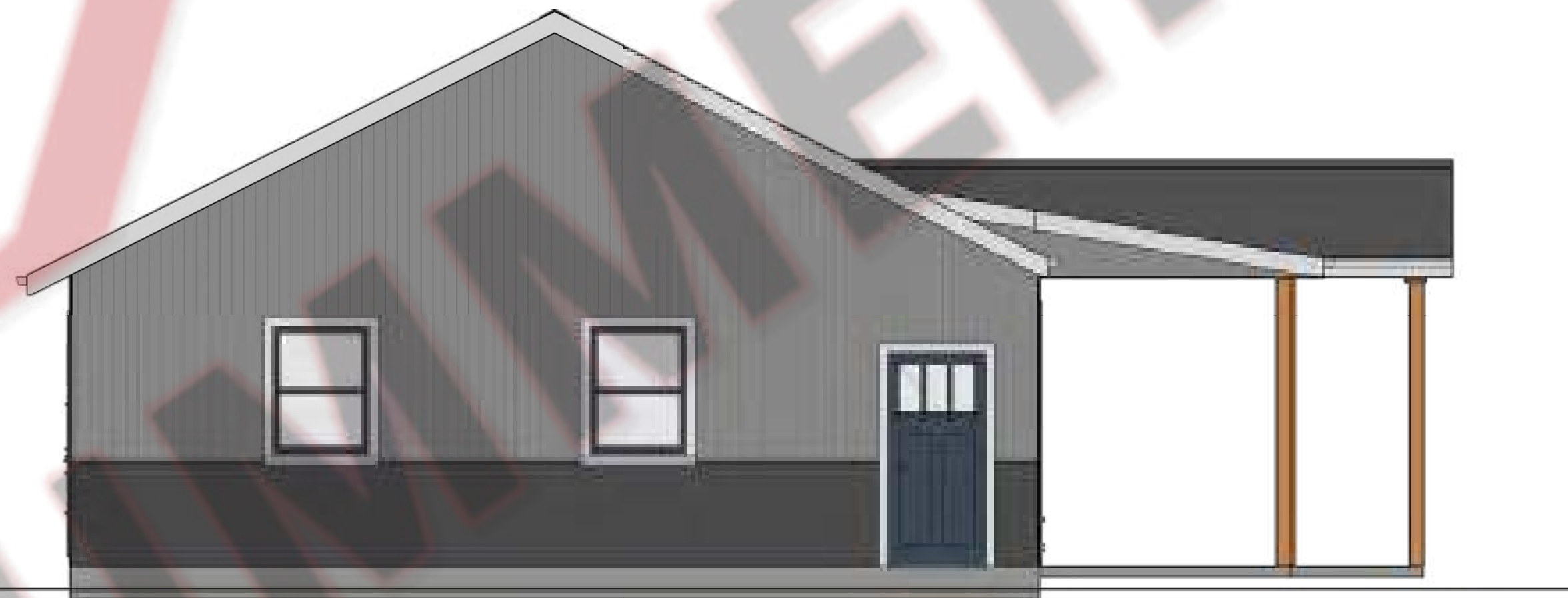
LEFT Elevation 2