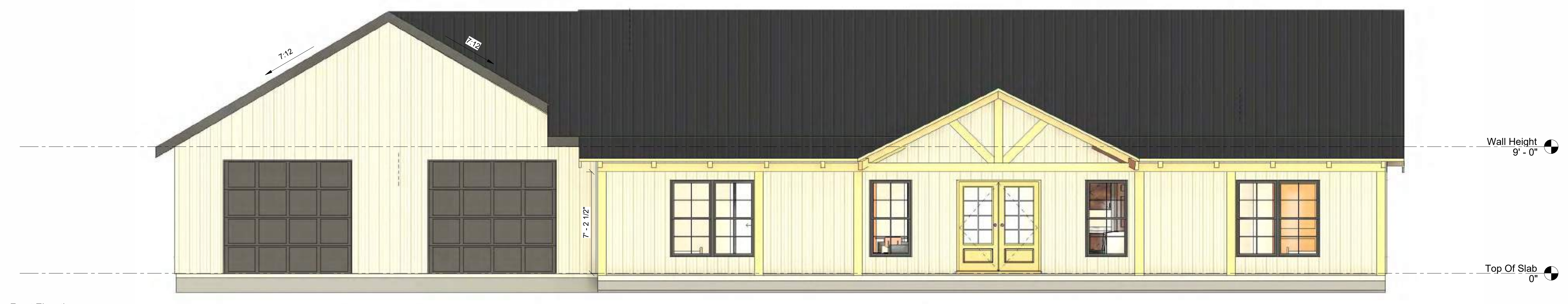
① Front Elevation 1/4" = 1'-0"