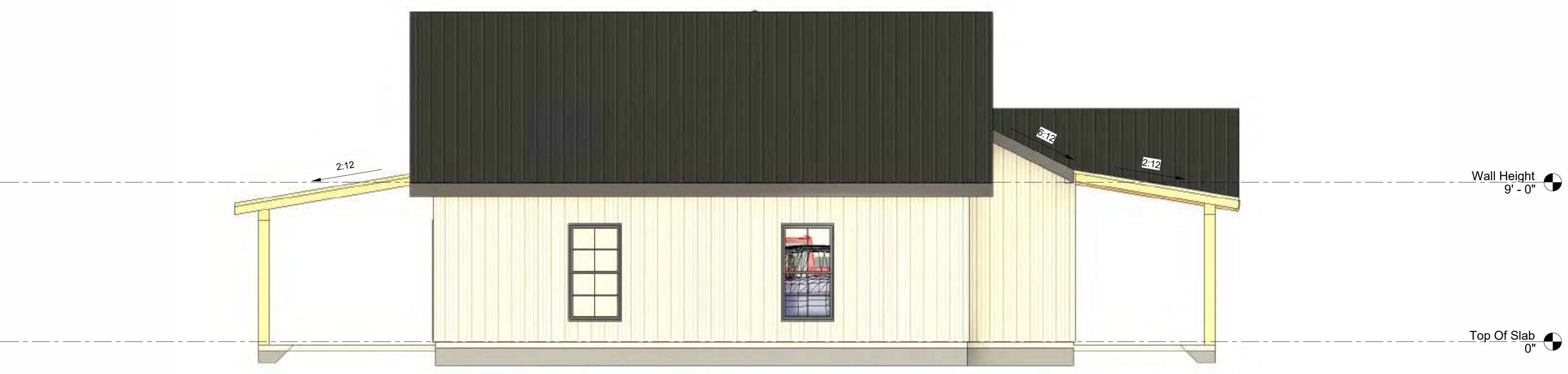
② Left Elevation 1/4" = 1'-0"